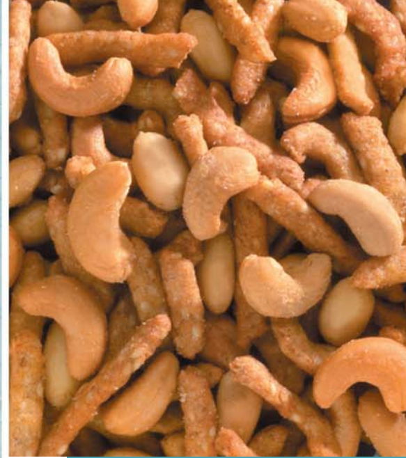
038 CASHEW SNACK MIX

A delicious new mix that will pair well with your favorite beverage – Salsa peanuts, taco sesame sticks, toasted corn kernels, cheddar sesame sticks, pepitas, and mini sesame chips. (6 oz. bag)