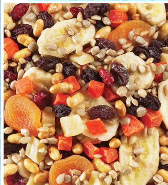
409 FRUITY TRAIL MIX