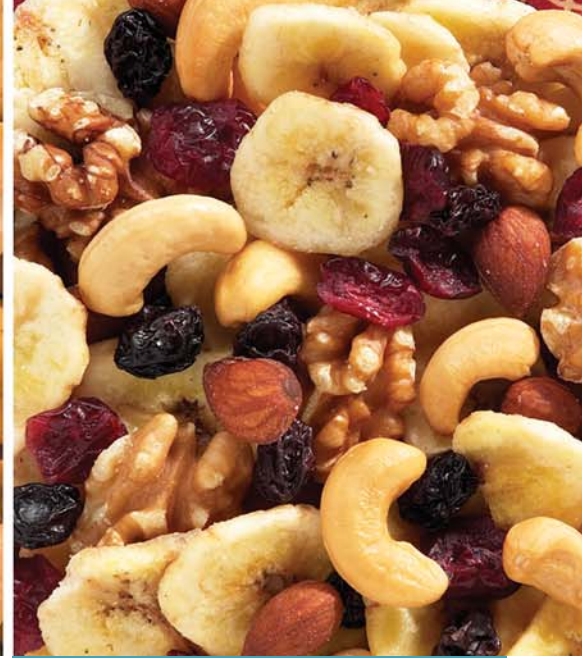
CRANBERRY TRAIL MIX 451