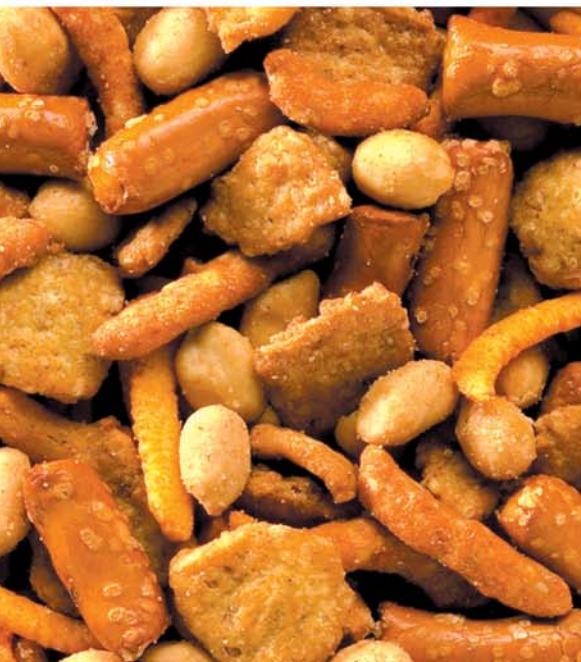
SAY CHEESE! MIX 004

EACH PRODUCT COMES PACKED IN AN AIR-TIGHT FOIL POUCH FOR FRESHNESS. PLATES, BOWLS AND CONTAINERS ARE NOT INCLUDED.