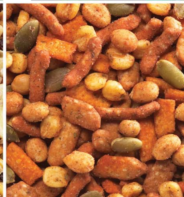
490 SALSA MIX