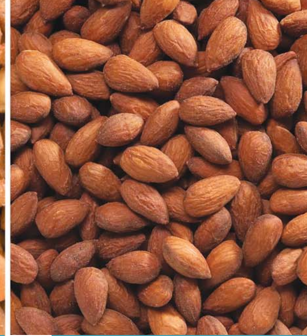
413 ROASTED & SALTED ALMONDS