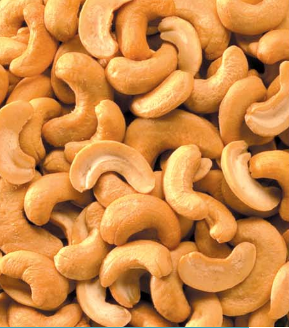
CASHEW HALVES 065