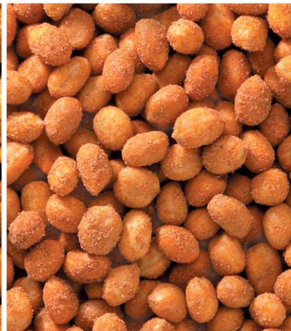
HOT N' SPICY PEANUTS 037