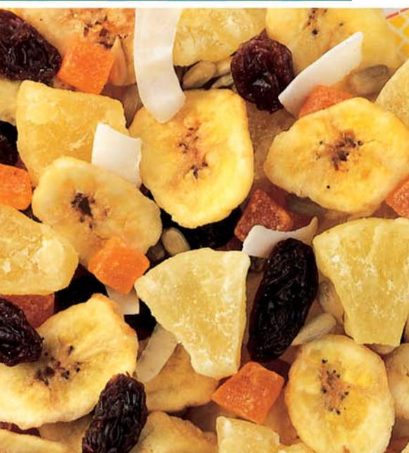
HAWAIIAN DELIGHT 009