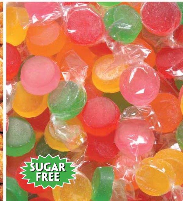
056 WILD FRUIT SUGAR FREE ASST CANDY